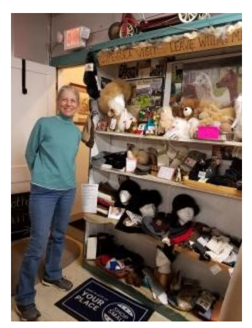
Taylorsville Main Street's Midnight Madness was a huge success and they had warm hats just in time for the blast of winter!

This will house the new office of Harrodsburg First upon completion.